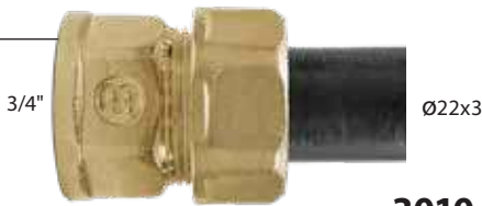
3/4" Female - Pex Ø22x3