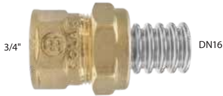
4361 3/4" Female - Inox DN16