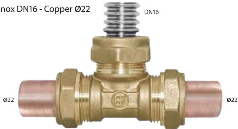
2162 Copper Ø22 - Inox DN16 - Copper Ø22