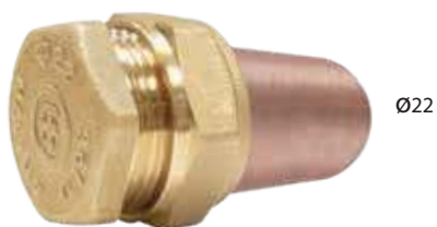
2200 Blind Cap for Copper Ø22