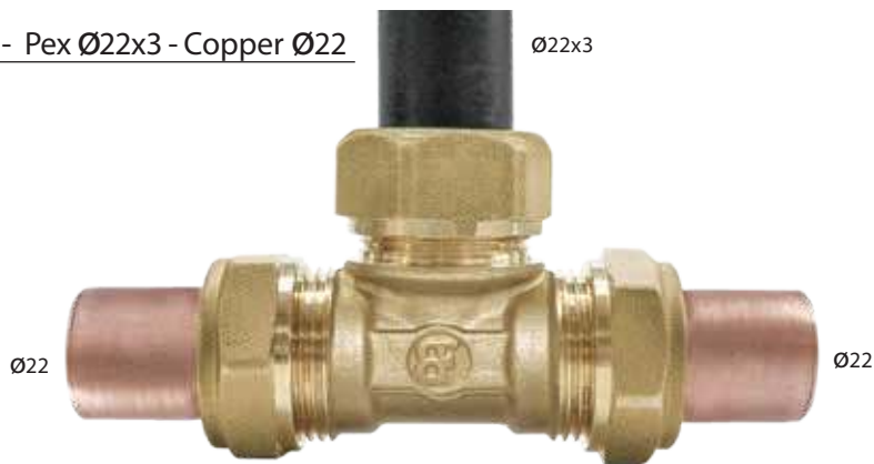
2232 Copper Ø22 - Pex Ø22x3 - Copper Ø22