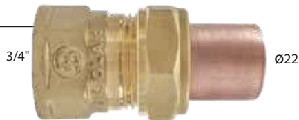
3/4" Female - Copper Ø22