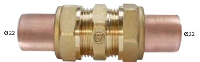
2222 Union for Copper Ø22